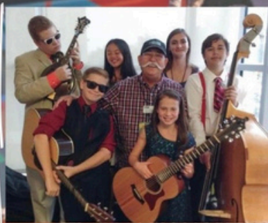
KIDS ON BLUEGRASS