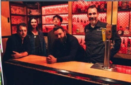
THE HIGH WATER LINE

"EARLY BIRD SPECIAL" 3 DAY W/CAMPING** $150.00 / ENDS SEPT. 12TH