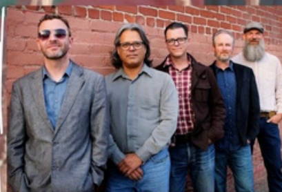
RED DOG ASH

"EARLY BIRD SPECIAL" 3 DAY W/CAMPING** $150.00 / ENDS SEPT. 12TH